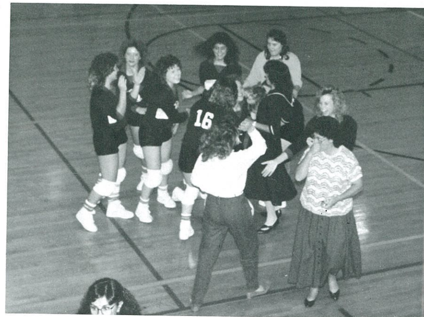
After winning the District Championship the Lady Wildcats show their excitement.

A rose bush is very much like a team. The rose bush is a very sturdy plant. The bush has a very hardy root system just as a team has all of its supporters and fans. Without the fans the team could not stand the test, especially the fans called "moms and dads." As in the life of the rose bush it has a sturdy support called a stem that it usually covers with lots of thorns. The teams stem is the coach who gives us her support and knowledge of the sport. The knowledge makes the thorns on the stem so that we can put up our offenses and defenses against all others who attack us. The team itself is the precisely placed rose petals. If you look at the rose bud you know that each petal has grown together to make the sweetest smelling flower in the world. But if you try to pull a petal apart from the others, the bud will fall completely apart. Each petal is supported by the others, as a team member should be supported by her teammates and if the rose petals or the team work and support each other as has been planned, they will always come out smelling like a sweet rose!